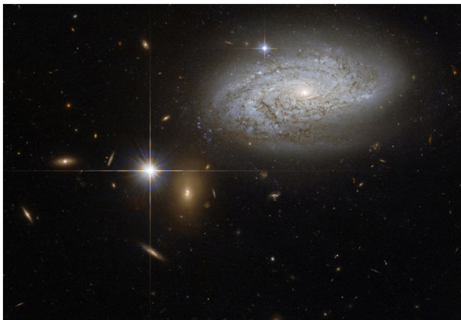
Figure 26.12 Type Ia Supernova. The bright object at the bottom left of center is a type Ia supernova near its peak intensity. The supernova easily outshines its host galaxy. This extreme increase in luminosity helps astronomers use Ia supernovae as standard bulbs.

A number of suggestions have been made for what sorts of objects might be effective standard bulbs, including the brightest supergiant stars, planetary nebulae (which give off a lot of ultraviolet radiation), and the average globular cluster in a galaxy. One object turns out to be particularly useful: the type Ia supernova . These supernovae involve the explosion of a white dwarf in a binary system (see The Evolution of Binary Star Systems ) Observations show that supernovae of this type all reach nearly the same luminosity (about 4.5 \times 10^9 L_{\text{Sun}} ) at maximum light. With such tremendous luminosities, these supernovae have been detected out to a distance of more than 8 billion light-years and are therefore especially attractive to astronomers as a way of determining distances on a large scale ( Figure 26.12 ).